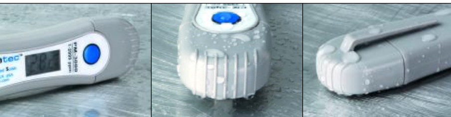
LARGE LCD DISPLAY